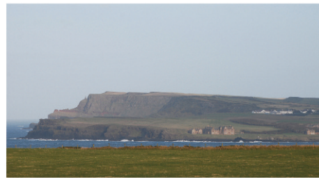
View of the cliffs of Causeway Head taken from Portballintrae.