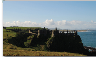
Top left: Dunluce Castle ruins with Whiterocks beach and Ramore Head in the background.