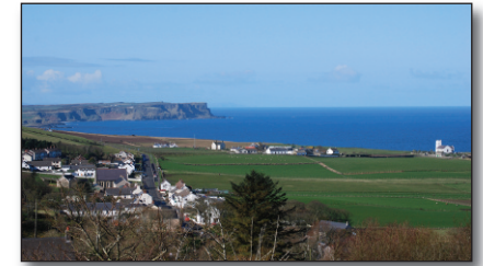
Top right: Carrick-a-Rede village looking towards Ballintoy.