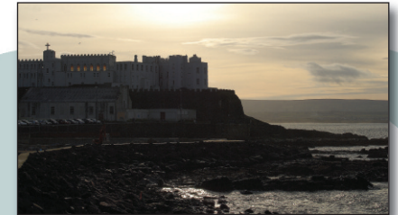
Bottom right: Dominican Convent in Portstewart.