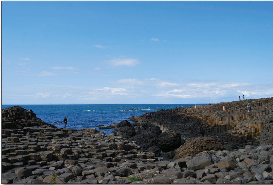
Above: The Giant's Causeway is an area of about 40,000 interlocking basalt columns and is the result of an ancient volcanic eruption.