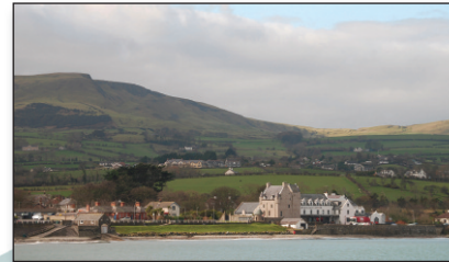
Bottom left: The Four Star Ballygally Castle Hotel, operated by the Hastings Group, is located at the foot of the Glens of Antrim.