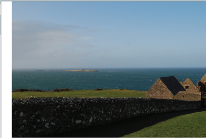
The Skerries – a small group of islands visible from many points including Dunluce Castle.