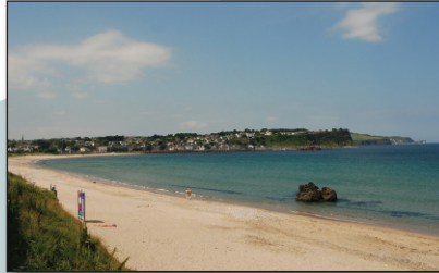
Right: Looking across Ballycastle Bay from Corrymeela.