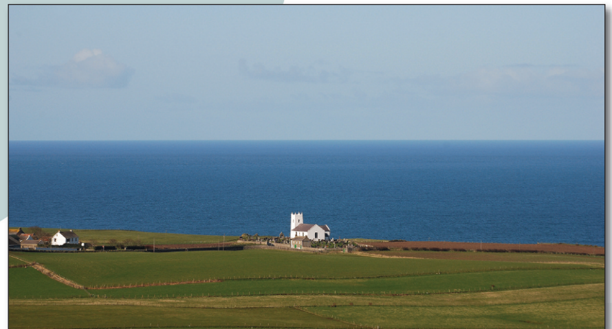
Below: A church perched on the cliff edge near White Head.